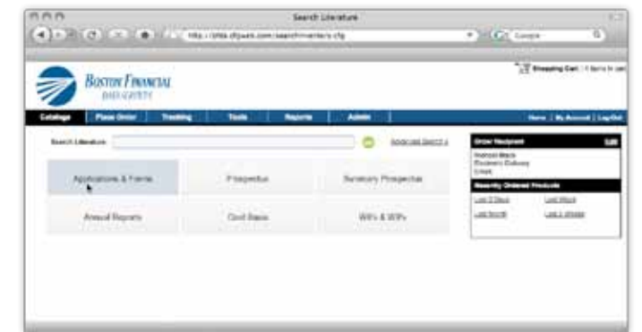
FIGURE 2 - KIOSKS NAVIGATION

ELEMENT's comprehensive library of your documentation and literature operates in real-time and is organized with thumbnail images, PDF file management, fax and email distribution functionality.