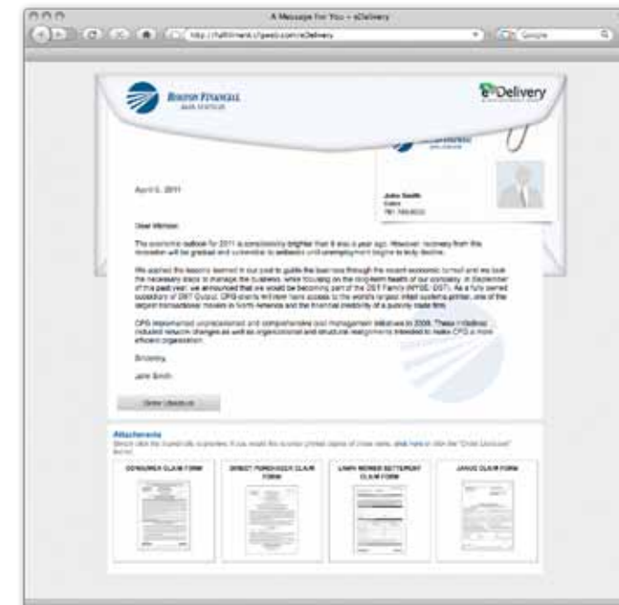
FIGURE 1 - SAMPLE ELEMENTS LAYOUT

Forge strong relationships and meet the needs of each individual client by building customized emails and microsites complete with pictures and video clips. Real-time reports and alerts tell you when your materials are opened so you can follow-up with clients.